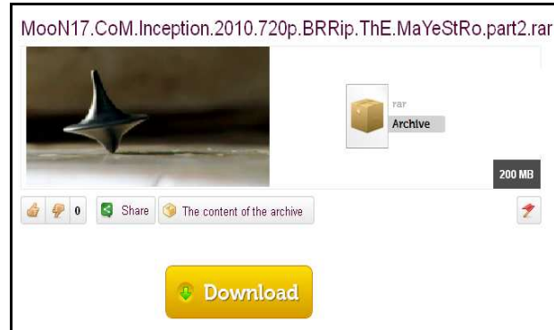
Fig. 2 Screenshot of the Mayestro's upload to Ulozto.net

Therefore, uploader The.Mayestro assures all the potential downloaders with the branding of his/hers uploaded data in order not to jeopardize his recognition status in the community (A.; Section II). [17]