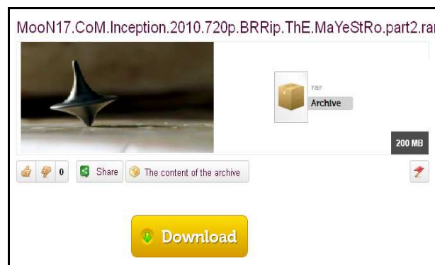
Fig. 2 Screenshot of the Mayestro's upload to Ulozto.net

Therefore, uploader The.Mayestro assures all the potential downloaders with the branding of his/hers uploaded data in order not to jeopardize his recognition status in the community (A.; Section II). [17]