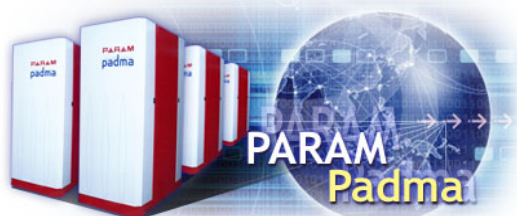
Fig. 2 Picture of C-DAC's Tera-Scale Supercomputing Facility (CTSF)