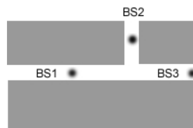
Fig. 2 A city segment with three BSs deployed on streets

In this section we will first look at the handoff issues in microcellular environments. Later, we will investigate some systems that use microcells overlaid by macrocells in order to minimize number of handoffs.