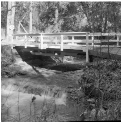
Figure 2. Bridge (256x256).

Fig. 6 illustrates the average running time per training vector per iteration. These results include not only the time needed for the distance computations, but also the time needed to sort the rows of the distance matrix in TIE, and thus TIE performs even worse. Overall, our M-tree variant clearly outperforms both TIE and simple GLA in clustering tasks involving a large number of clusters.