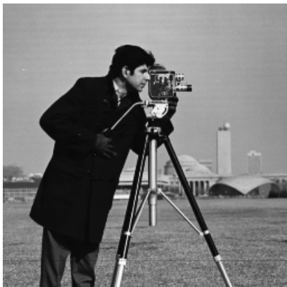
Figure 3. Camera (256x256).