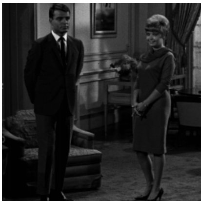
Figure 4. Couple (256x256).